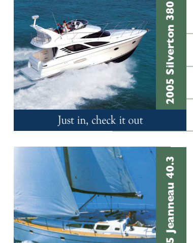
CW's Value Boat of the Year

With an exciting blend of Navigator trademarks, efficient hull design, superb visibility and owner customized fabrics-it's no wonder the 53 Classic is becoming their most popular model. Just in $497,000