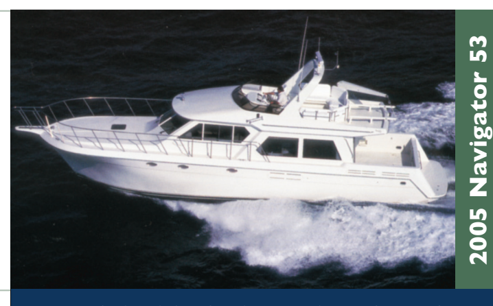
LUXURIOUS DESIGN, OUTSTANDING PERFORMANCE

With an exciting blend of Navigator trademarks, efficient hull design, superb visibility and owner customized fabrics-it's no wonder the 53 Classic is becoming their most popular model. Just in $497,000